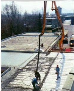
end hose in use