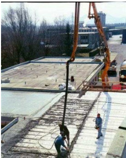
end hose in use