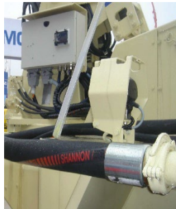
connection hose in use